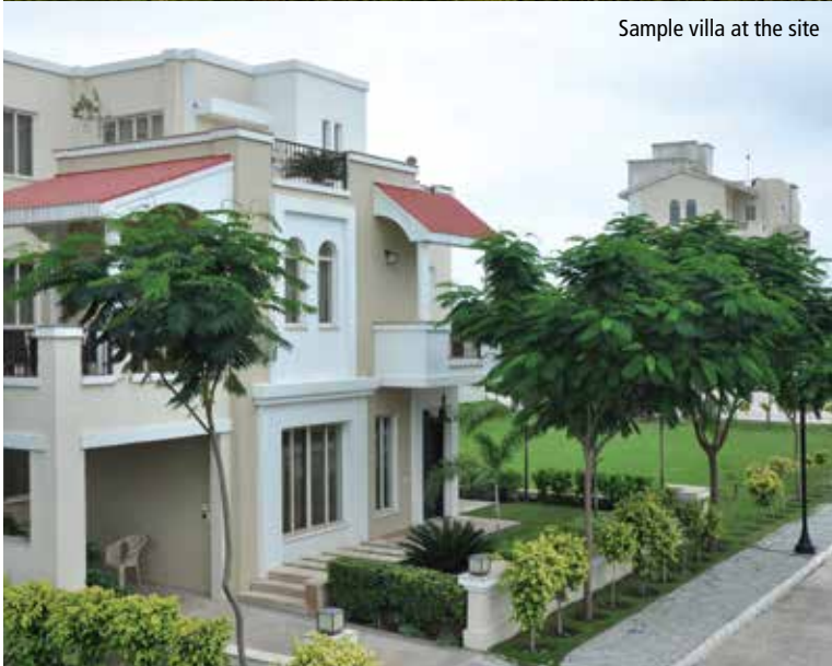
Sample villa at the site