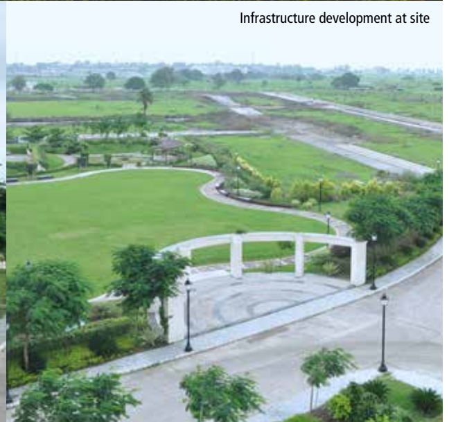
Infrastructure development at site