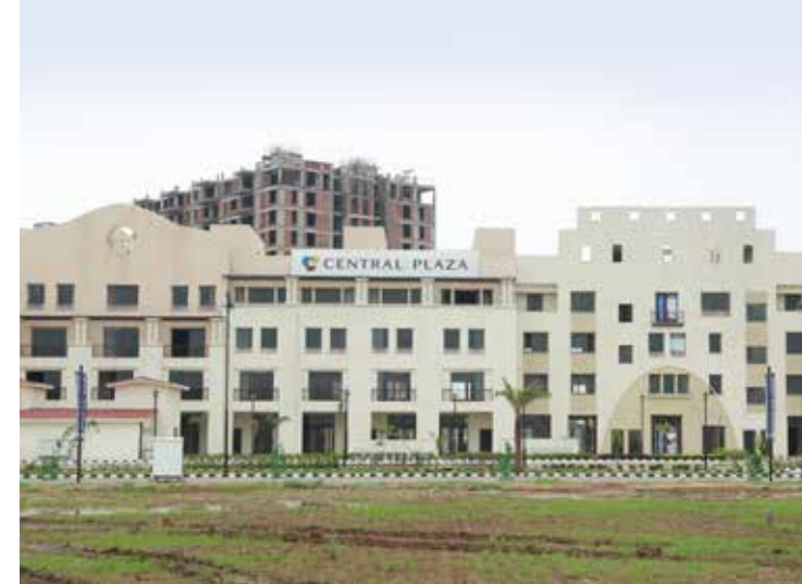
Site photos of Central Plaza